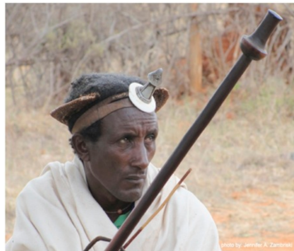
Photo 1. Boran pastoralist, Dirre, July 2011

and objectively verifiable, and cannot be manipulated by either party to the insurance contract. In order for IBLI to be successful in Boran, it must be synergistic with successful coping mechanisms currently in place, as well as risk management modalities under development. It is therefore essential to have a thorough inventory and critical evaluation of