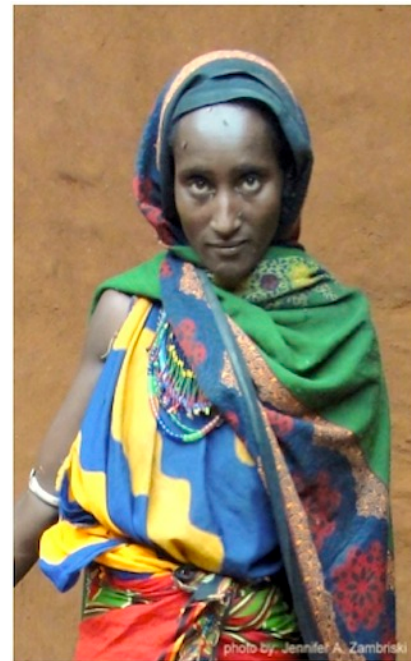
Photo 7. Boran woman, Dillo, July 2011

Many of the issues raised in this document pertinent to livestock health, herd mobility, and rangeland management are traditionally the responsibility of men in Boran society. Domestic activities are the primary role of women. Therefore, labor is often divided along gender lines. In FGDs, women noted that their responsibilities included: taking care of children, food preparation, medical care for the family, and other activities which involved maintenance of the household. In contrast, typical responsibilities of men include tending to livestock, locating suitable grazing land and water points, and animal health.