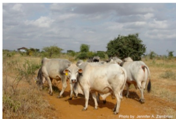
Photo 9. Boran cattle at the Boran Cattle Breeding Center

Another potential opportunity in the region is via collaboration with the Boran Cattle Breeding Center. This center is dedicated to the preservation and improvement of Boran cattle breed, and raises several hundred cattle