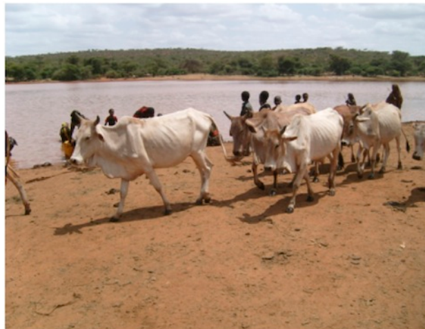
Photo 6. Livestock watering pond near Haro Bake market

In many areas, communities and individuals have been encouraged to build shallow ponds (which may hold water for a few weeks or months per year) by both government and NGOs. Ponds are often found in wet season grazing areas so as