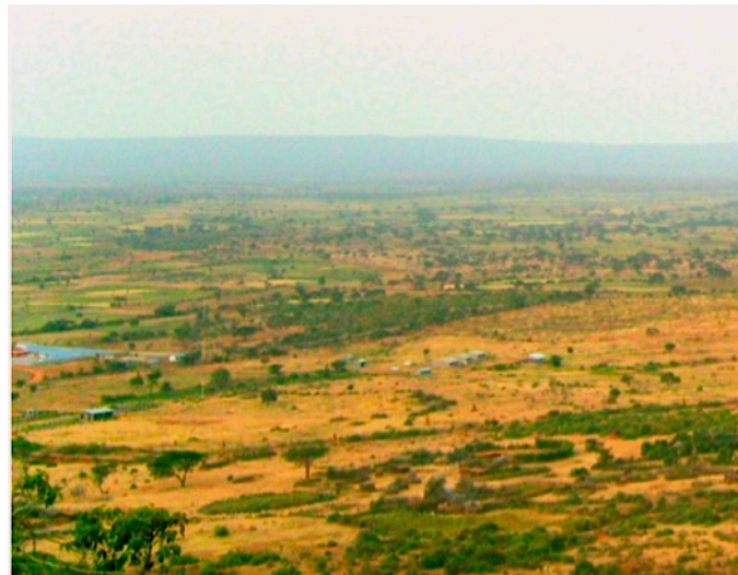
Photo 4. The greener area to the center left marks the edge of the government ranch

There are a number of government and private “ranches” in Borana. The Dida Tuyura government ranch north of Yabelo also houses a breeding center. Some private ranches are run by cooperatives, but there have been reports of more powerful pastoralists controlling these (McCarthy et al., 2003; Temesgen, 2010). Not much was mentioned about ranches