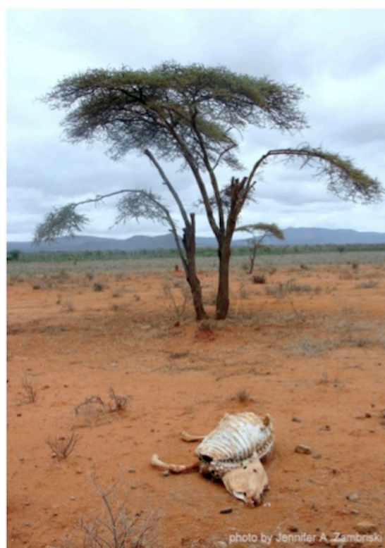
Photo 3. Unconsumed remains near Moyale in August 2011 point towards high livestock mortality during the current drought

Although large herds may represent economic and food security, livestock herd size is also correlated with animal well-being and herd mortality. Larger