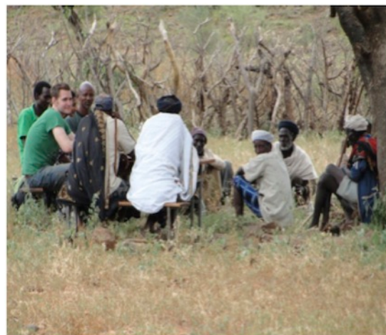
Photo 2. Elders FGD in Sarite

In each community, community members and local government development agents (DAs) helped ILRI staff members identify 6-8 individuals in each target category: elders, individuals who currently herd, and non-retired women. Invitations to participate were delivered by the DAs in advance of the FGDs. On the day of the FGD, the IGERT team arrived with at least three translators whom we felt confident had command of