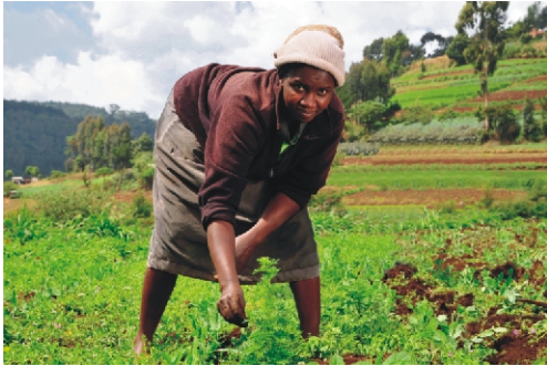
Farmer in Central Kenya.