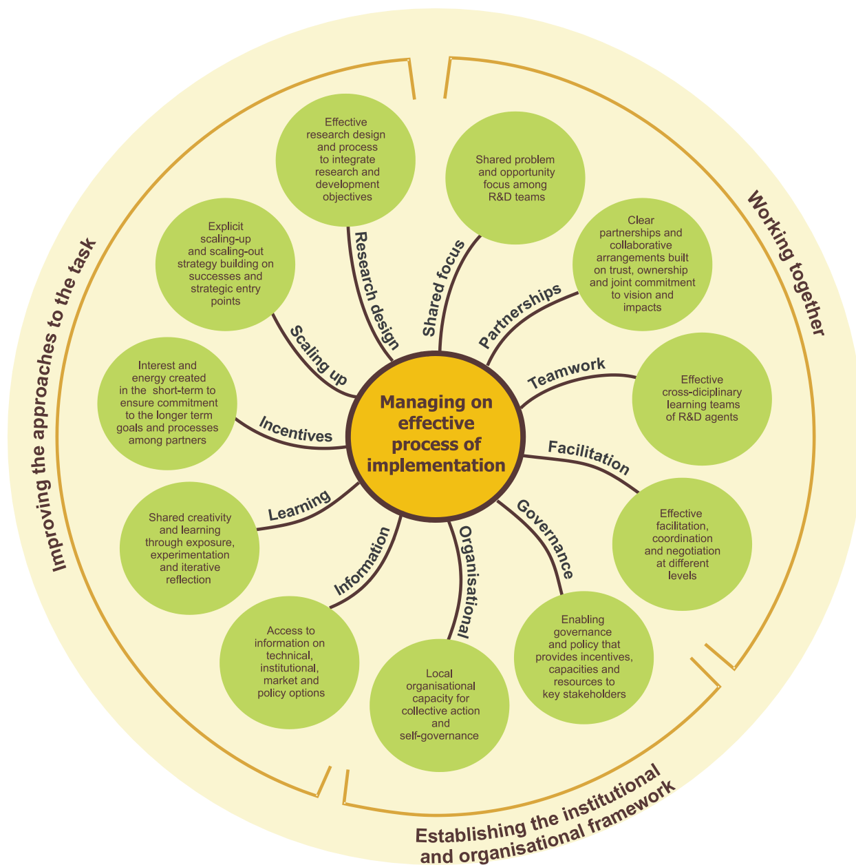
Figure 2. Cornerstones of successful research for development that achieves widespread impact 3 ).

The planned outcomes cover an interwoven package of technologies, approaches and policies for both adaptation and mitigation and are targeted at various levels, from the farm to the global policy arena. CCAFS has defined impact pathways tailored to specific opportunities, working back from the outcomes desired to the outputs needed to achieve those outcomes, the partners needed to deliver on the outputs and critical