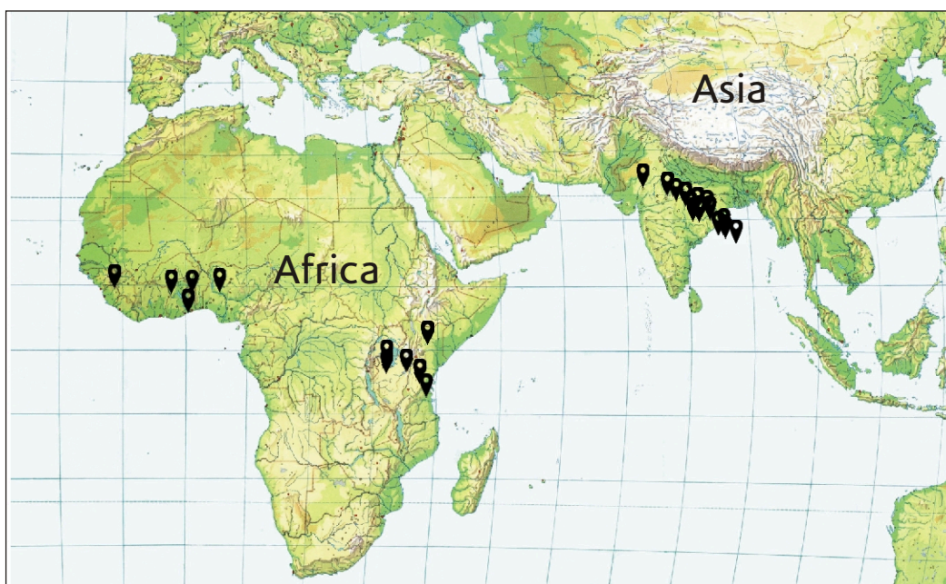
Map of CCAFS benchmark sites in 2011

Much of the place-based research will be undertaken within so-called target regions and will share common research sites and infrastructure where appropriate. CCAFS activities will be fully integrated with CGIAR Research Program on Integrated Agricultural Production Systems for the Poor and Vulnerable in Dry Areas in shared target regions. The three initial focus regions are East Africa, West Africa and the Indo-Gangetic Plains. Criteria for selecting the initial focus regions were: