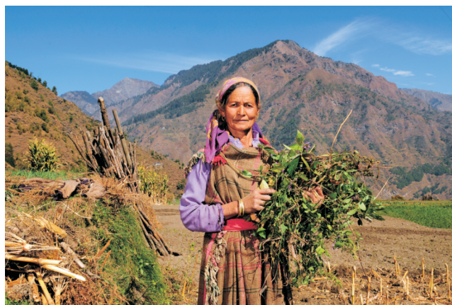
Himachal Pradesh, India.